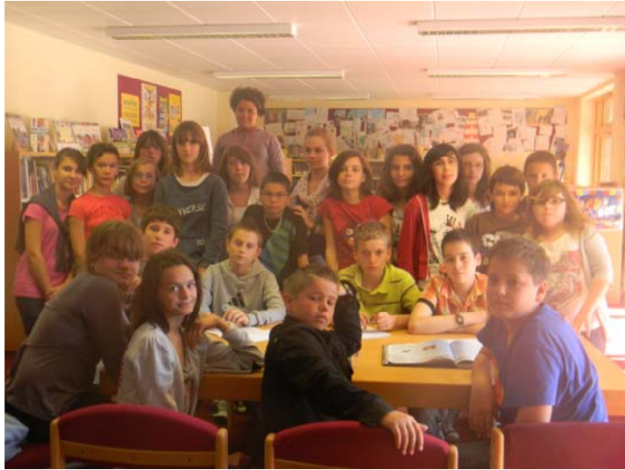
Our French visitors enjoy life at Homefield

The highlights of this half-term have been the visit of the U6th French pen-friends; 25 pupils of the Collège Pharamond Savary, Gouzeaucourt, spent 3 days with us. They visited the school, took part in lessons and enjoyed our school lunch. They also visited sites in London, Dover and Canterbury. The L6th are looking forward to their turn to visit Gouzeaucourt and Paris next Summer.