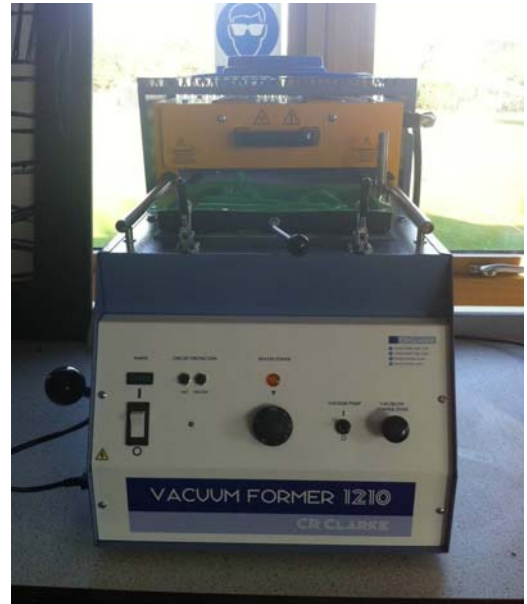
The department has just unwrapped its new vac-forming machine!