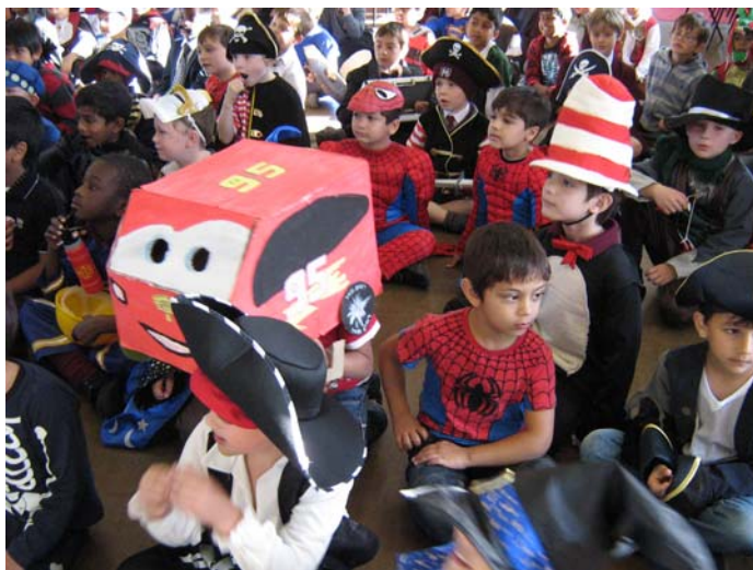
A huge array of characters and costumes