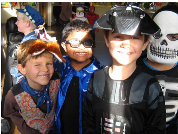
A great, fun day!