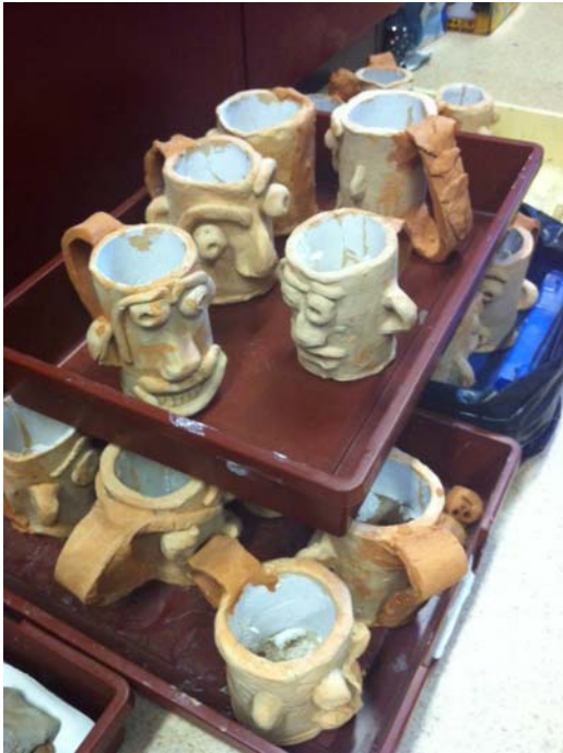
The kiln is running around the clock at present. Some of you may be getting ceramics under the tree this Christmas!