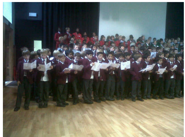
Epsom Choral Day

Sixty-three Lower 4 pupils sang at the Epsom College Prep Schools' Choral Day and a number of boys have attended weekend orchestral days at Trinity and Whitgift schools.