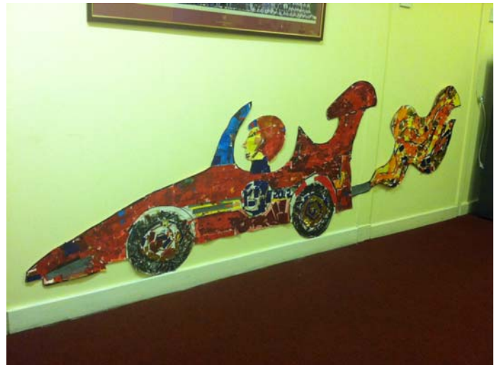
3H have been working as a team to collage this enormous racing car!