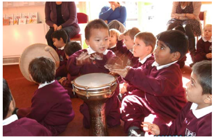
The Early Years' Unit enthusiastically join in with our storyteller

The final week of the half term finished with a visit from a story teller and the boys dressing as a character from their favourite book for Book Character Day.