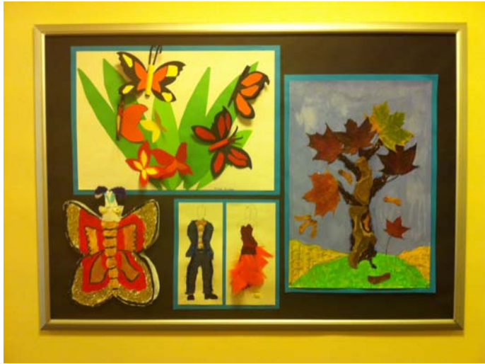
We are currently installing new frames around the school to display some of the brilliant work the boys produce!