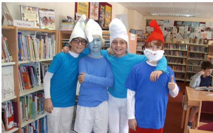
The Smurfs come to Homefield