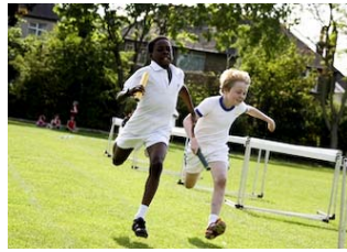
Sporting action from the athletics meeting

On Friday 21 st May, Homefield hosted a match in three different age groups.