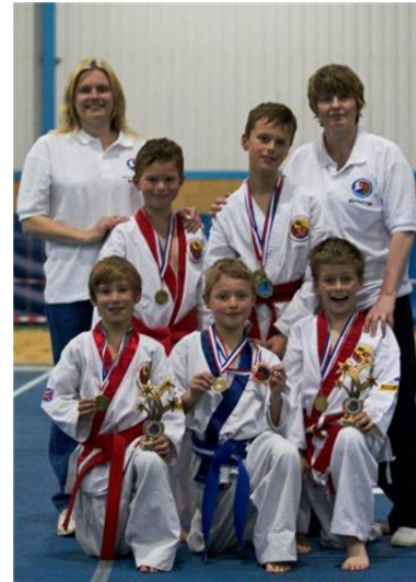
Proud Snow Herons medal recipients