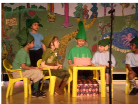
The Goblin Next Door