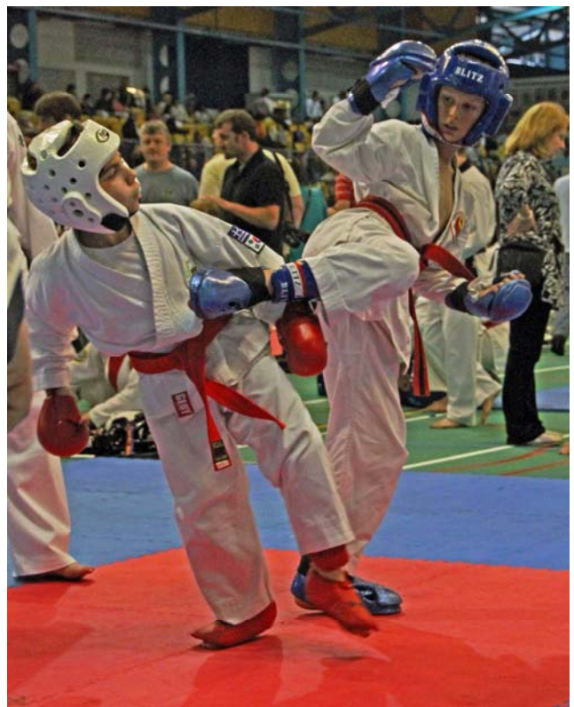
Sparring at the Cardiff World Championships

In a remarkable performance by the team, every boy who took part came home with at least 1 trophy, and we now have a number of World Champions!