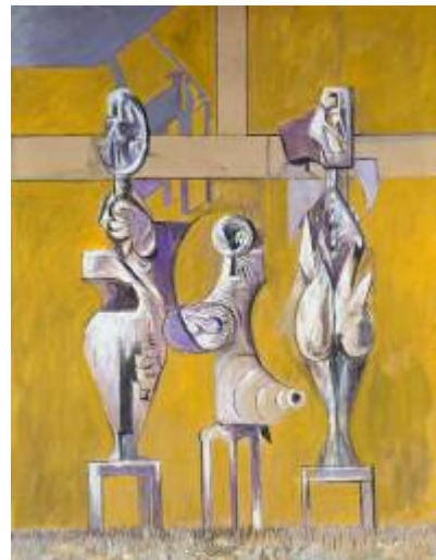
Graham Sutherland – Standing Forms II