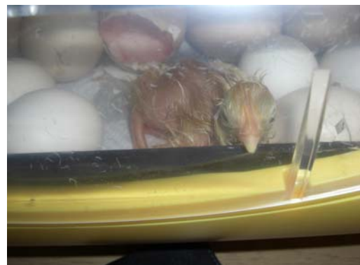
A new member of Homefield!