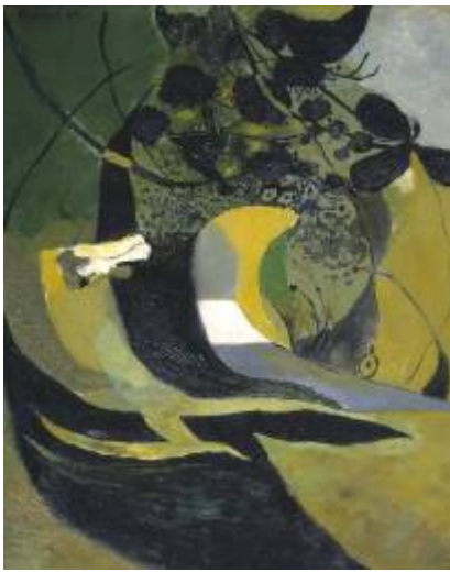
Graham Sutherland – Entrance to a Lane