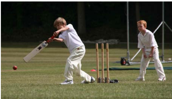
Sporting batting action from the U9s