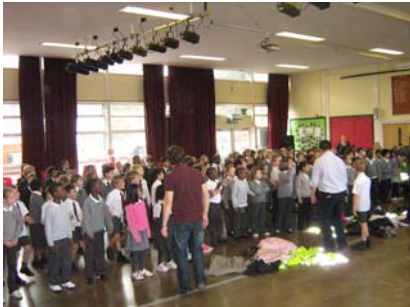
Voces 8 visit Homefield

Back in January the 3 rd Form joined forces with pupils from Manor Park School and Robin Hood School in a concert with the professional Vocal Ensemble Voces 8. They performed on the third floor of the St Nicholas centre to a large and enthusiastic audience of parents and shoppers.