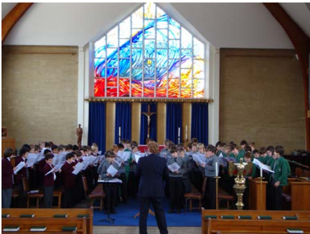
Homefield visit St John's School, Leatherhead

On March 16 th 30 trebles from the chamber choir joined with the St John's choir and boys from Aldro and Chinthurst to sing choral evensong. The boys gave a fantastic performance of a very taxing programme as the St John's choir were repeating the service that they had sung in Winchester Cathedral the previous Sunday.