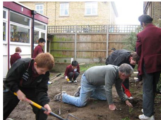
The Eco-council tilling the soil