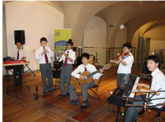
Members of the Instrumental Ensemble

The term was completed by a recital by members of the 6 th form. Performances were given by the Jazz Orchestra, 6 th form Percussion Ensembles and a rock band that the boys had organised themselves. There were 40 solo performances on instruments ranging from xylophone to saxophone and the wealth of talent was staggering.