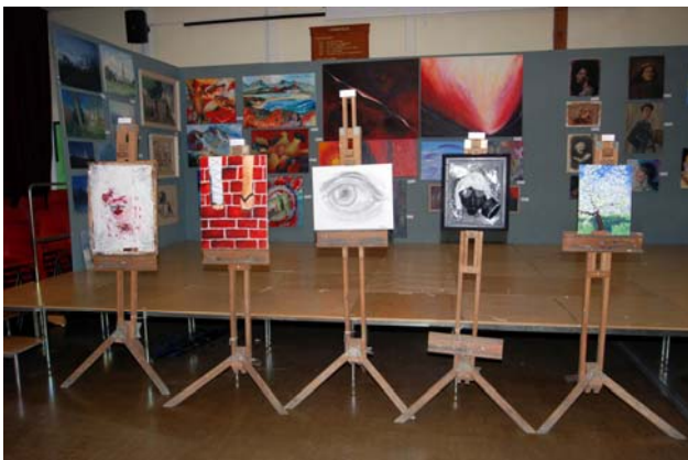
An array of Homefield artistic talent

Thank you to all the parents and numerous neighbours who braved the cold to peruse and purchase paintings.