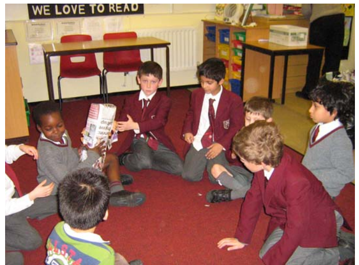
The Learning Resources Christmas party