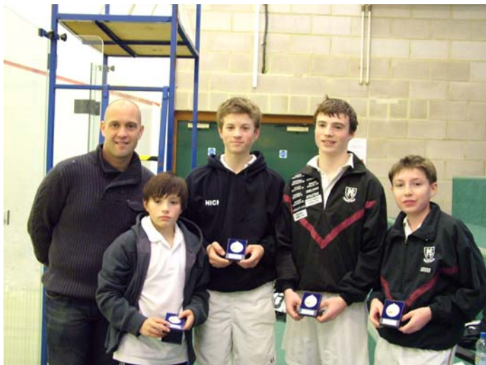
Homefield runner-up team in the Surrey Schools Competition