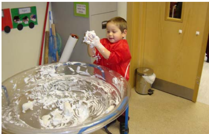
An investigation of snow!

In Literacy we have continued to learn our sounds along with the name of the letter. We have started learning our high frequency words and used these to form sentences to read and write. We have been writing for different purposes for example: letters to Santa, fire work noises and lists of ingredients.