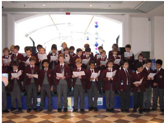
The Chamber Choir sing at St Nicholas Shopping Centre