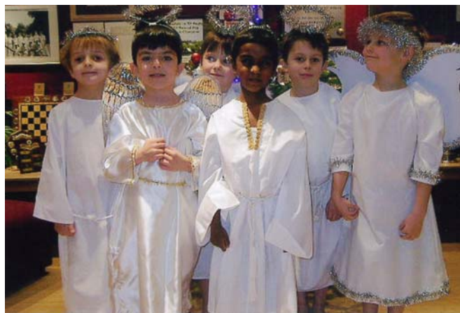
The Junior Department 'Angels'