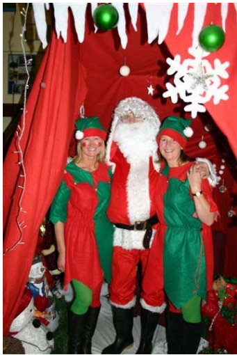
Santa and his 'elves' visit Homefield

It has been an extremely busy term for the Association, with the Fireworks Party, Northbrook wrapping paper, plum puddings, Westfield shopping trip, Macmillan coffee morning, and not least the Christmas Bazaar. However, we will be back next term to plan the famous Quiz Night and a coffee morning (with a 2 nd hand uniform sale), so watch this space.