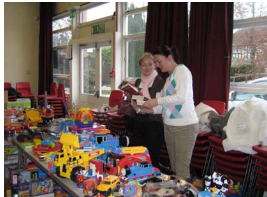
A fine array of toys on offer at the Christmas Bazaar

Last week ended splendidly with the Christmas Bazaar, and despite the snow impeding preparations & donations, it proved to be a great success on the day. Thank you to everyone who contributed donations or time, and I hope you were all rewarded with huge appreciative smiles from your boys (and perhaps a bag of bazaar bounty!).