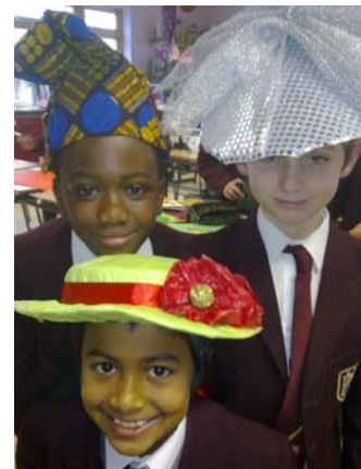
The Homefield Milliners proudly display their creations

Here are next term's Art homework. You can complete them in any order. You should spend 2 weeks on each one. You should spend at least 80 minutes on each homework; longer if you wish and your parents allow. You can ask me as many questions before and during as you like. Always look at other