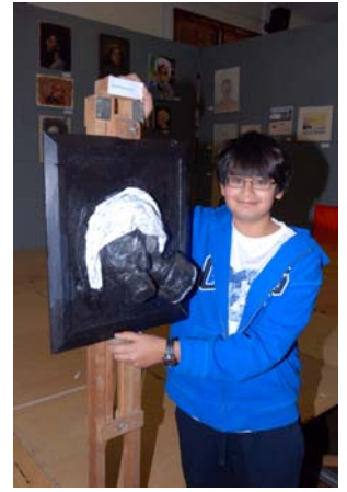
Homefield Art Exhibitors

The local Sutton Guardian paper also sent a journalist. All were impressed by the variety and quality of the work of arts exhibited and are hoping to be able to return to a future exhibition.