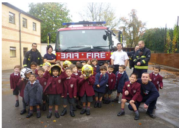
The Fire Brigade visit the Homefield EYU

Other discussions were based on the emergency services and included a fire engine visit. Some boys had the chance to try on the firemen helmets and we were all able to watch a fire hose demonstration. Finally, we talked about some of the busiest people at this time of year – the postal workers.