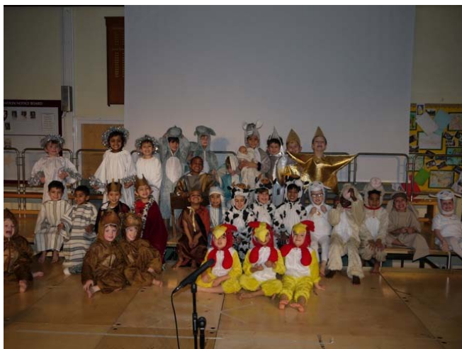
An array of Transition performers

We hope you all enjoyed the Nativity as much as we did. The boys were all stars!