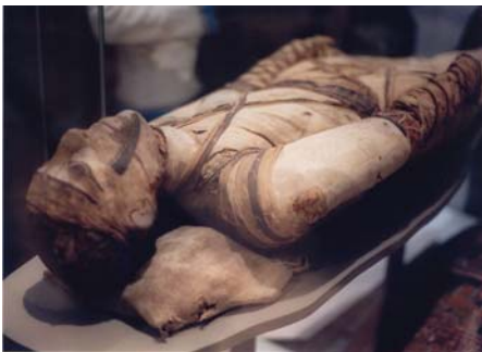
'Mummy' at the British Museum

The Year 3 made their annual trip to the British Museum to visit the Egyptian Galleries on Wednesday 24 th of November. It was a very successful and beneficial outing. The learning experience was great. The highlights for the boys were seeing Ginger and Bones, the famous Rosetta Stone, and the mummified animals.