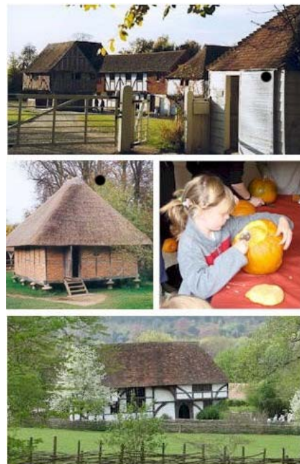
The Weald and Downland Museum

After the games, we quickly nipped off to the gift shop. There was quite good stuff there and in the end I got an archery set, which actually works quite well! Now it was time for lunch so we went back to the bag room and ate lunch. Two more activities left to enjoy!