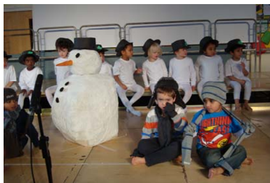
The Nursery performance of 'Snowman at Sunset'

The boys all enjoyed the Christmas party, having lots of fun playing party games, eating party food and especially the surprise visit from Santa.